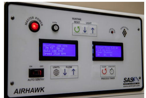
AirHawk's Advanced Control Panel