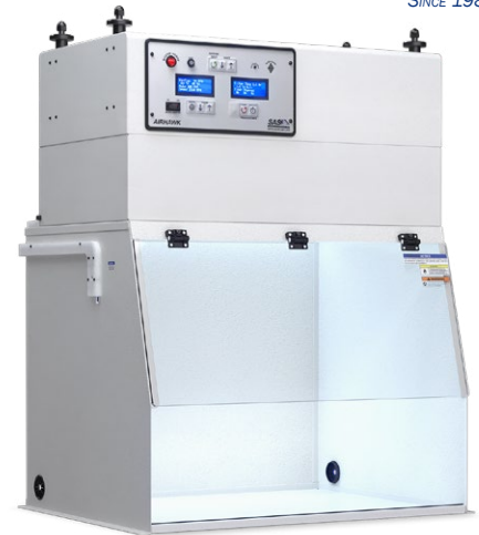
30" AirHawk Ductless Fume Hood

Typical applications for the AirHawk include chemical fumes, pharmaceutical compounding, soldering, light dust removal, biological, solvent or epoxy use, and many more applications that require the removal of fumes and particulate. Upgrade your respiratory protection to the AirHawk and experience an improved workflow with the automatic features and beneficial user configurations.