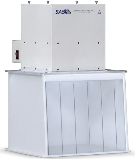
12" Mini Ductless Fume Hood

Our line of ductless fume hoods are not intended for sterile compounding applications.