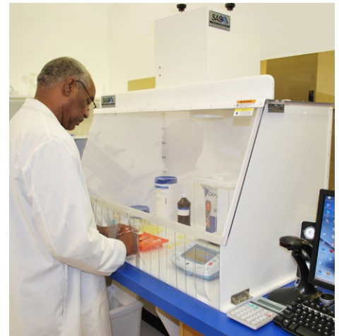
30" DCH provides fume control for a various medical applications.