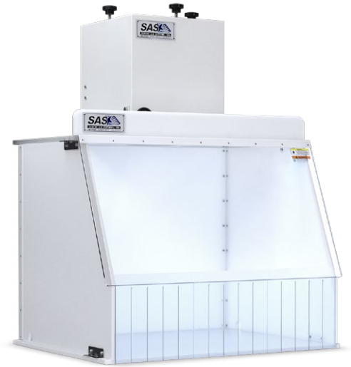
30" Ductless Fume Hood

Our line of ductless fume hoods are not intended for sterile compounding applications.