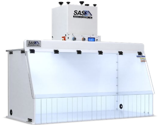
50" Ductless Fume Hood - Generation II

The 50" Wide Ductless Fume Hood – Generation II helps protect the operator and environment from hazardous fumes or particulate generated from applications performed within the hood. The new and improved design of this fume hood includes an adjustable light, variable speed fan control, and a digital display with an hour counter and digital magnehelic gauge. The adjustable light and fan controls enable the operator to make modifications suitable for the application. The digital hour counter shows the time the unit has been operated in hours to keep PM schedules for filter changes. The digital magnehelic gauge measures the static pressure on the filter in order to monitor the filter saturation. This unit also features an external reset button and programmable alerts.