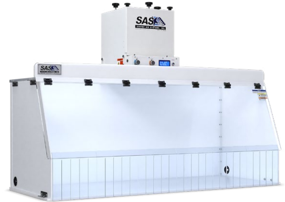
60" Ductless Fume Hood - Generation II

The 60" Wide Ductless Fume Hood – Generation II helps protect the operator and environment from hazardous fumes or particulate generated from applications performed within the hood. The new and improved design of this fume hood includes an adjustable light, variable speed fan control, and a digital display with an hour counter and digital magnehelic gauge. The adjustable light and fan controls enable the operator to make modifications suitable for the application. The digital hour counter shows the time the unit has been operated in hours to keep PM schedules for filter changes. The digital magnehelic gauge measures the static pressure on the filter in order to monitor the filter saturation. This unit also features an external reset button and programmable alerts.