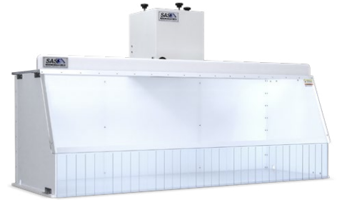
70" Ductless Fume Hood

Our line of ductless fume hoods are not intended for sterile compounding applications.