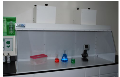
70" DCH can be fitted with dual blowers for increased airflow.