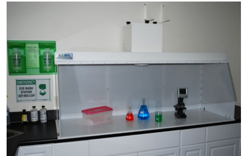
70" DCH provides chemical fume control.