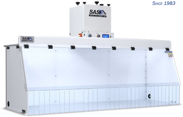
70" Ductless Fume Hood - Generation II

Generation II helps protect the operator and environment from hazardous fumes or particulate generated from applications performed within the hood. The new and improved design of this fume hood includes an adjustable light, variable speed fan control, and a digital display with an hour counter and digital magnehelic gauge. The adjustable light and fan controls enable the operator to make modifications suitable for the application. The digital hour counter shows the time the unit has been operated in hours to keep PM schedules for filter changes. The digital magnehelic gauge measures the static pressure on the filter in order to monitor the filter saturation. This unit also features an external reset button and programmable alerts.